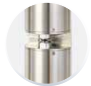
Self Cleaning Brush