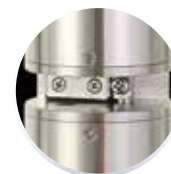
Self Cleaning Brush