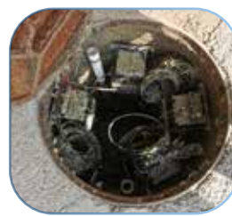
Urban domestic sewage monitoring