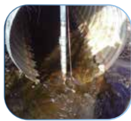
Surface water, rainwater, ground-water monitoring