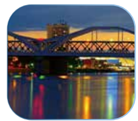
River, watershed monitoring