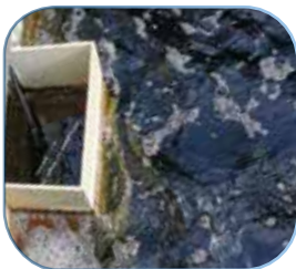
Sewage treatment plant outlet monitoring